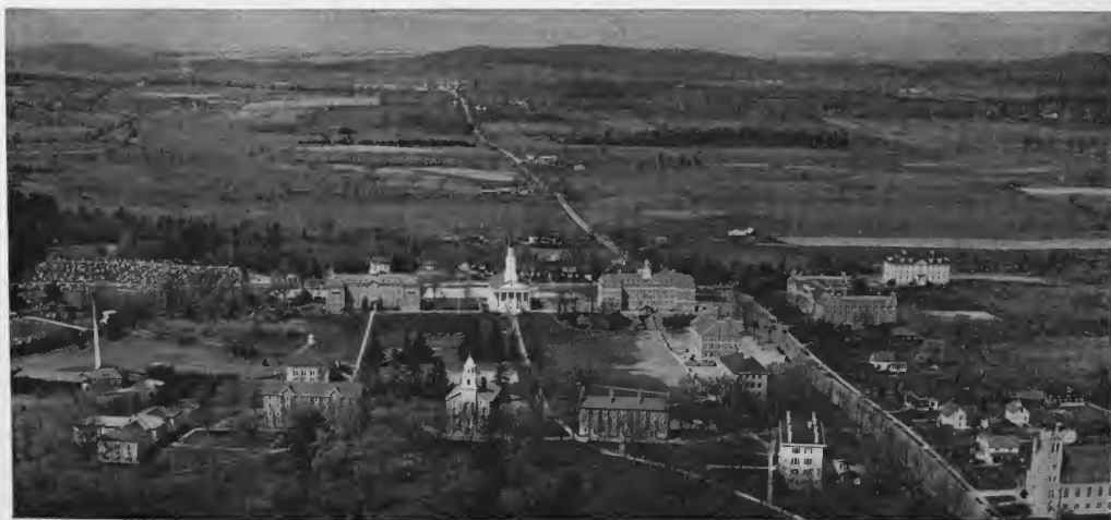
Middlebury College, 1941

The library is as good a key as any department to college changes over a long period and here the figures speak with eloquence. In 1921 there were approximately [Continued on page 17]